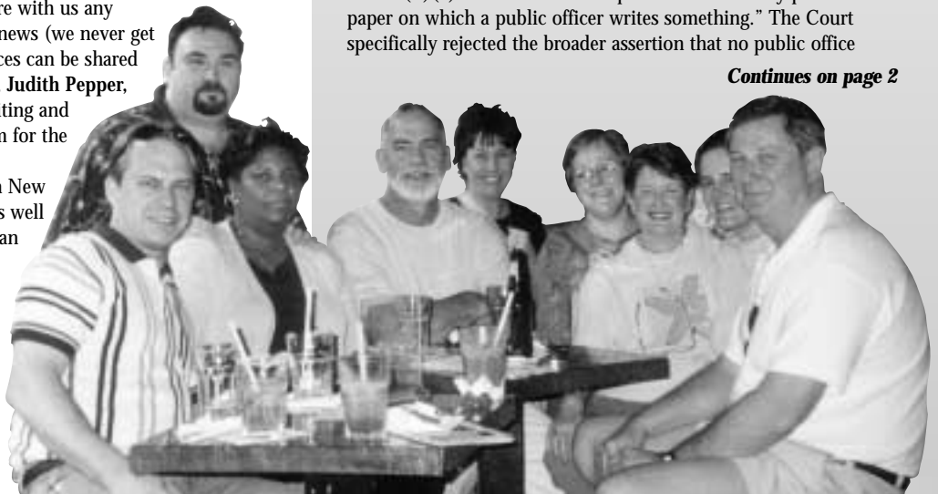
OHPELRA members in a New Orleans club after a day at the NPELRA Annual Conference